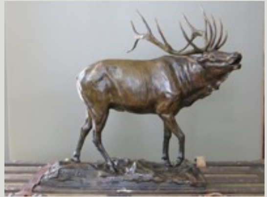
Sharon Walker was a Best in Show winner at Reflections with her elk sculpture.

This workshop will be an informal hands on introduction in to sculpting animals from life. We will start with the measuring process and then move into building an armature for our model. The medium that will be used is an oil based clay that never hardens and is always workable.